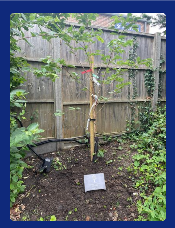
The Cherry Blossom Tree planted in honour of the Queens' Platinum Jubilee (June 2022) unveiled in St Andrews House gardens